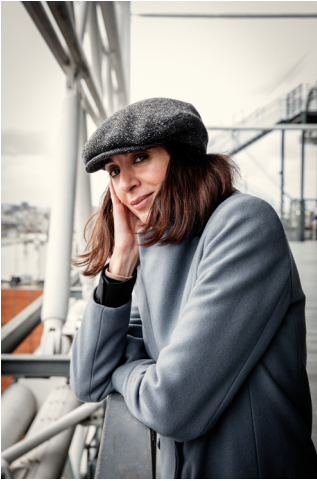
Bouchra Khalili

“For over 20 years, I have meditated on a series of simple questions: when someone speaks, who speaks? When we speak, do we speak alone? Who stands behind us, speaking with us?”