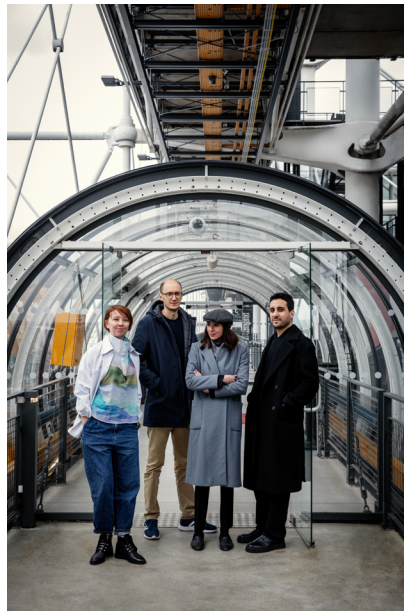
The 4 artists nominated for the Prix Marcel Duchamp 2023