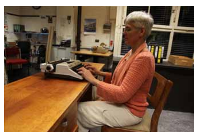
Kader Attia Extracts from the film-essay « Réfléchir la Mémoire », 2016 courtesy l'artiste, Galleria Continua, Galerie Nagel Draxler, Lehmann Maupin, et Galerie Krinzinger