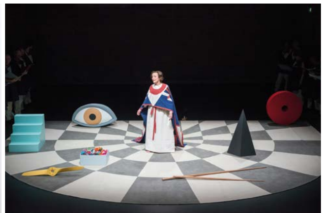
Exhibition view, Baisse-toi montagne, Leve-toi vallon , Kaatheater Brussels 18-19 March 2015 Commissioned "Les Nouveaux Commanditaires" de la Fondation de France, with the support of Fondation de France and Famille Moulin's endowment fund