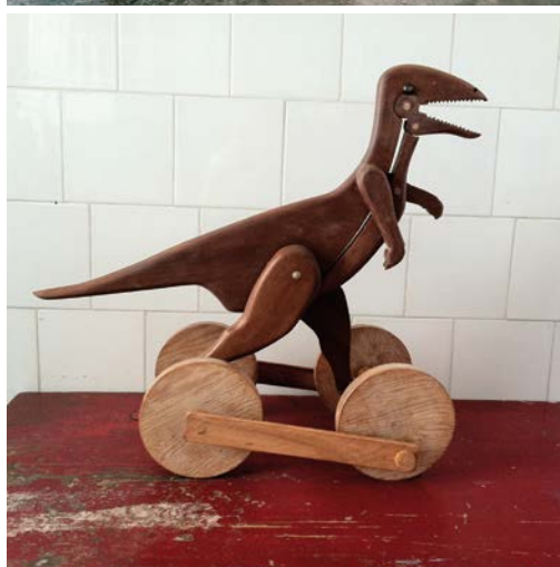
4. Carcharodontosaurus Toy, 2015 Bois, 45 x 52 x 23 cm Courtesy the artist, and Galerie Polaris, Paris