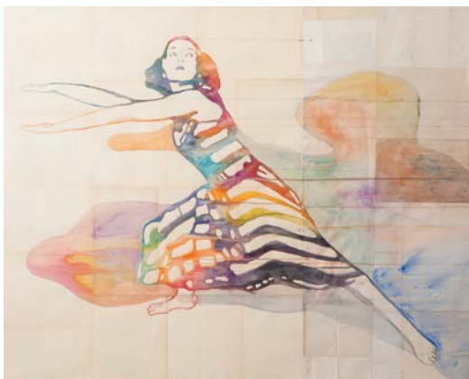
Mary , 2015 Watercolor on ancient paper, Private Collection, Vienna