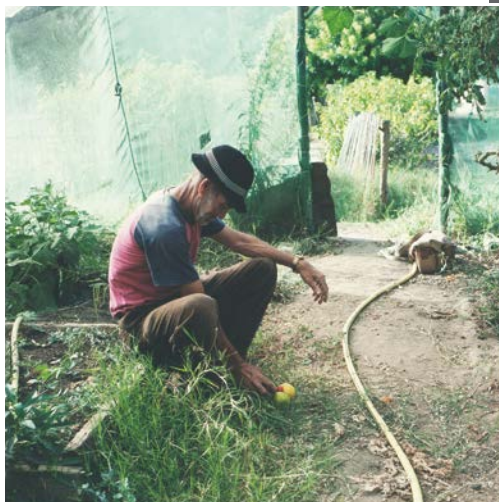
1. Paysage dit de la Mujer Muerte, Digital print, 80 x 80 cm