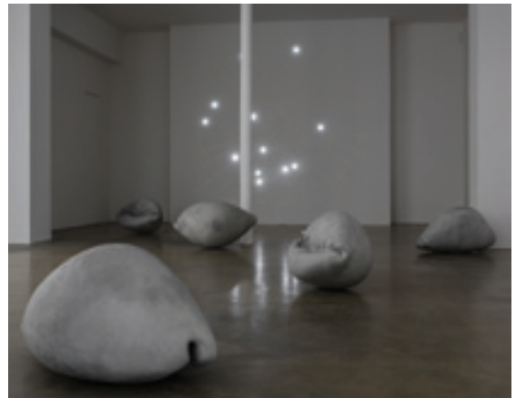
VIEW OF THE EXHIBITION STUTTERING AT THE GALERIE CHANTAL CROUSEL (12 DECEMBRE 2014 - 6 FEBRUARY 2015)