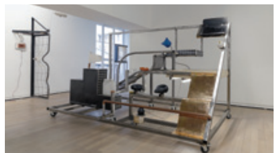
VIEW OF INSTALLATION: NÉIL BELOUFA, "EN TORRENT ET SECOND JOUR", FONDATION D'ENTREPRISE - RICARD, PARIS, FRANCE, 2014