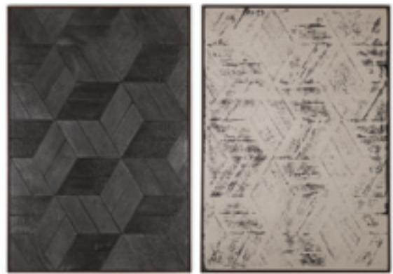
BURNT PAINTING. IMPRINT OF THE BURNT PAINTING (DOUBLE CUBES) (2013), BURNT WOOD, BURNT WOOD DUST ON CANVAS, 195 X190CM, © ZARKO VIJATOVIC, COURTESY GALERIE FRANK ELBAZ