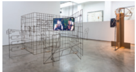
VIEW OF INSTALLATION, NÉIL BALOUFA, "COUNTING ON PEOPLE", INSTITUTE OF CONTEMPORARY ARTS - LONDON (ICA), LONDRES, UK, 2014