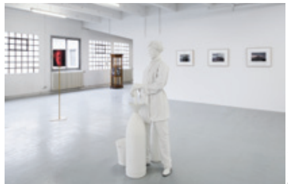
VIEW OF THE EXHIBITION STUTTERING AT CUSTOMS / GALERIE CHANTAL CROUSEL (12 DECEMBRE 2014 - 6 FEBRUARY 2015) COURTESY THE ARTIST AND GALERIE CHANTAL CROUSEL, PARIS.