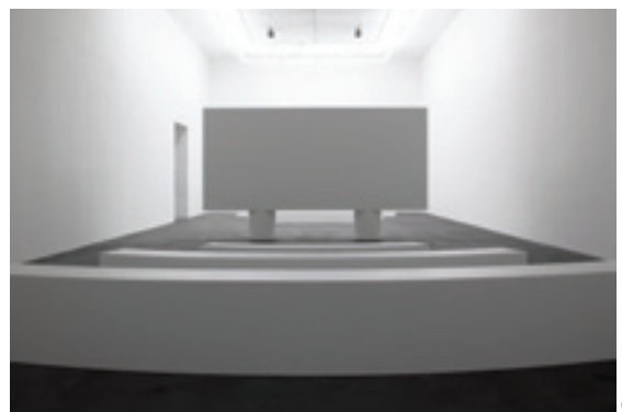
DAYS, I SEE WHAT I SAW AND WHAT I WILL SEE. 2011 HD VIDEO, SOUND - SYNCHRONIZED DOUBLE PROJECTION. 42 MIN VIEW OF EXHIBITION STUTTERING AT THE CENTRE REGIONALE D'ART CONTEMPORAIN LANGUEDOC-ROUSSILLON / SETE (4 JULY - 21 SEPTEMBRE 2014)