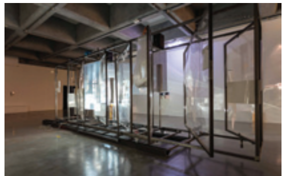
SUPERLATIVES AND RESOLUTION, PEOPLE PASSION, MOVEMENT AND LIFE, 2014, VIDEO INSTALLATION, MIXED TECHNIQUE, VARIABLE DIMENSIONS, UNIQUE VIEW OF INSTALLATION: "9 TH TAIPEI BIENNIAL", TAIPEI, TAIWAN 2014 © TAIPEI FINE ARTS MUSEUM