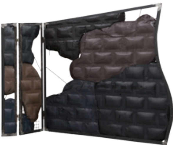
"SECURED WALLS" SERIES, 2014, EXPANSIVE FOAM, PIGMENTS, WOOD AND STEEL, APPROX. 175 X 230 X 45CM, UNIQUE © CLAIRE DORN

Extract from the 2015 Marcel Duchamp Prize catalogue (text by Emilie Renard)