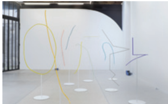
VIEW OF THE EXHIBITION _A JOURNEY THROUGH YOU AND THE LEAVES_ , GALERIE FRANK ELBAZ, PARIS (2015)