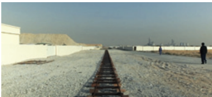
DAYS, I SEE WHAT I SAW AND WHAT I WILL SEE. 2011 HD VIDEO, SOUND - SYNCHRONIZED DOUBLE PROJECTION. 42 MIN COURTESY THE ARTIST AND GALERIE CHANTAL CROUSEL, PARIS.