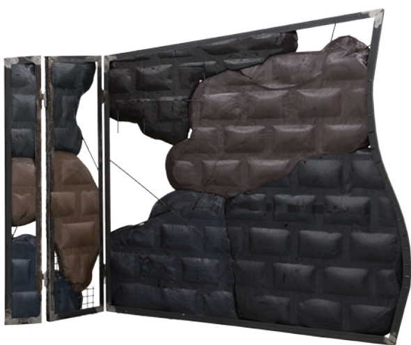
"SECURED WALLS" SERIES, 2014, EXPANSIVE FOAM, PIGMENTS, WOOD AND STEEL, APPROX. 175 X 230 X 45CM, UNIQUE

Extract from the 2015 Marcel Duchamp Prize catalogue (text by Emilie Renard)