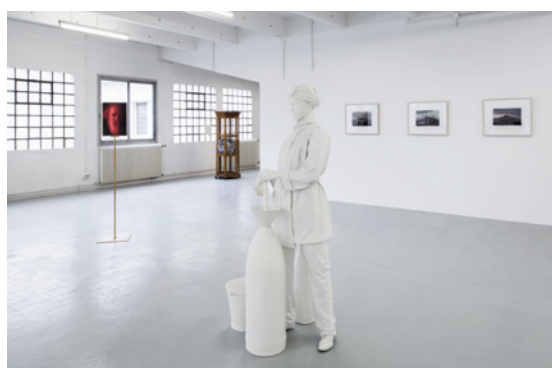
VIEW OF THE EXHIBITION STUTTERING AT THE GALERIE CHANTAL CROUSEL (12 DECEMBRE 2014 - 6 FEBRUARY 2015)