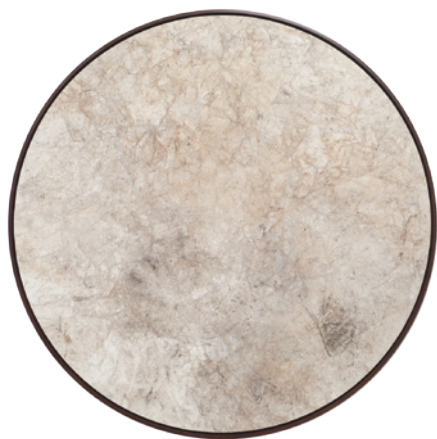
RIVER PAINTING (TORSEY CREEK, MAINE) (2014), SEDIMENTS ON CANVAS, 178CM DIAMETER