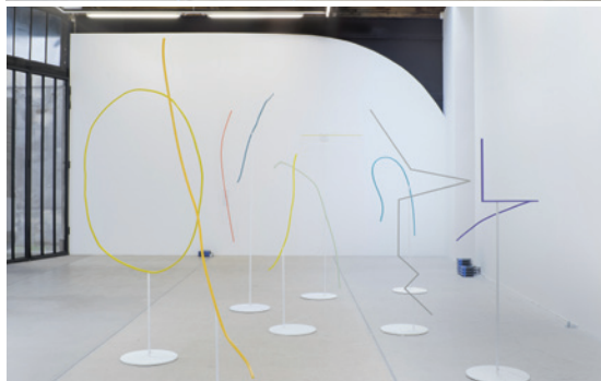
VIEW OF THE EXHIBITION _A JOURNEY THROUGH YOU AND THE LEAVES_, GALERIE FRANK ELBAZ, PARIS (2015)