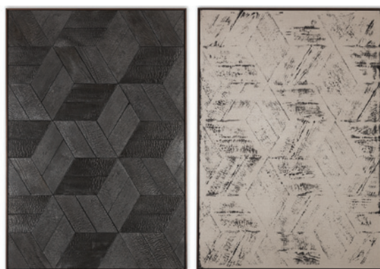
BURNT PAINTING, IMPRINT OF THE BURNT PAINTING (DOUBLE CUBES) (2013), BURNT WOOD, BURNT WOOD DUST ON CANVAS, 195 X190CM, © ZARKO VIJATOVIC, COURTESY GALERIE FRANK ELBAZ