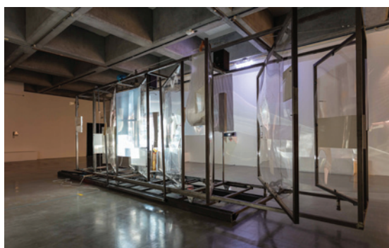
SUPERLATIVES AND RESOLUTION, PEOPLE PASSION, MOVEMENT AND LIFE, 2014, VIDEO INSTALLATION, MIXED TECHNIQUE, VARIABLE DIMENSIONS, UNIQUE VIEW OF INSTALLATION: "9TH TAIPEI BIENNIAL", TAIPEI, TAIWAN 2014