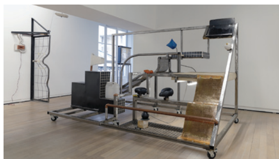
VIEW OF INSTALLATION: NÉIL BELOUFA, " EN TORRENT ET SECOND JOUR ", FONDATION D'ENTREPRISE - RICARD, PARIS, FRANCE, 2014