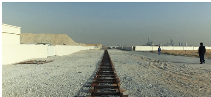
DAYS, I SEE WHAT I SAW AND WHAT I WILL SEE , 2011 HD VIDEO, SOUND - SYNCHRONIZED DOUBLE PROJECTION, 42 MIN COURTESY THE ARTIST AND GALERIE CHANTAL CROUSEL, PARIS.