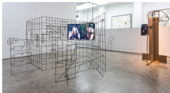
VIEW OF INSTALLATION, NÉIL BALOUFA, " COUNTING ON PEOPLE ", INSTITUTE OF CONTEMPORARY ARTS - LONDON (ICA), LONDRES, UK, 2014