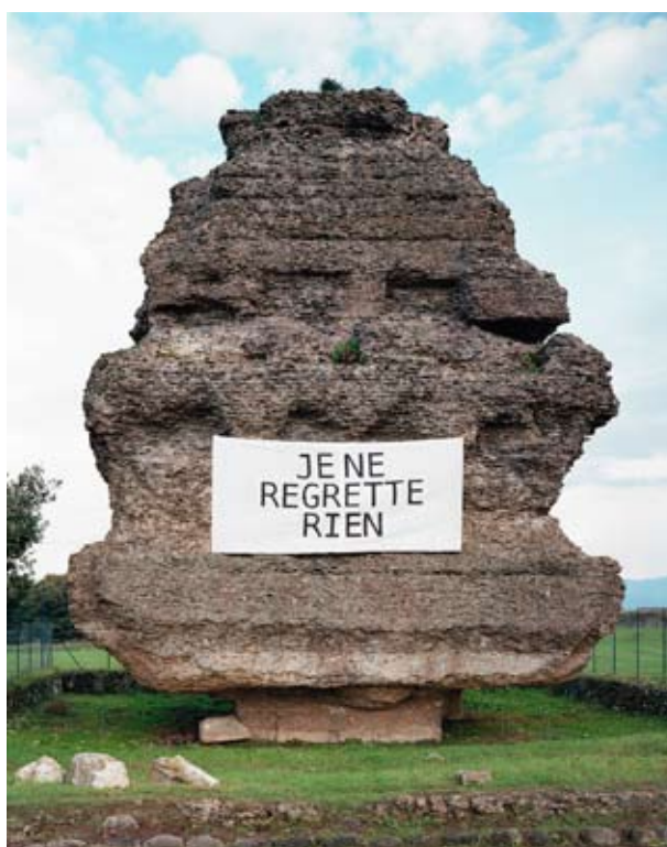
Je ne regrette rien Silver photograph 160X200 cm , 2014, with Erwan Fichou