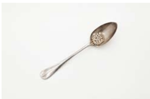
«Je suis une caverne» (2010) Silver spoon, 61 cavern pearls, 20 x 5 x 4cm Courtesy: the artist, Schleicher/Lange Berlin and Meessen De Clercq, Brussels

Extracts from the 2014 Marcel Duchamp Prize catalogue (text Florence Ostende)