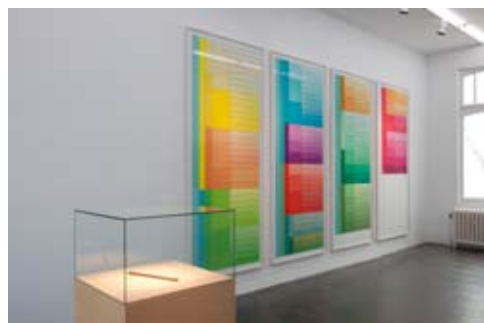
Continuum 5 (2013) View of the exhibit "Continuum", Meessen De Clercq, Brussels Background: Evariste Richer, Geological Scale, 2009 Inkjet print on paper, 270 x 110cm (each) Foreground: Evariste Richer, Le Mètre Lunaire, 2012 Copper, 27.27cm