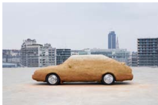
C'était mieux demain Sculpture, 2013