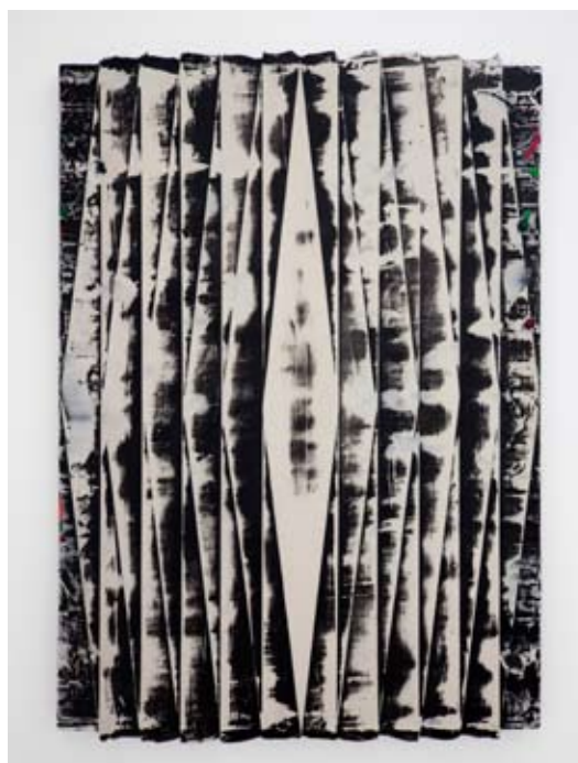
Stripe Painting 7. 2013 Gesso and acrylic on wood, 63 x 46cm Private collection