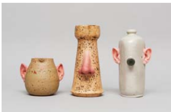
Les Demoiselles d'Avignon, Potteries, 2013

Extracts from the 2014 Marcel Duchamp Prize catalogue (text Stéphane Corréard)