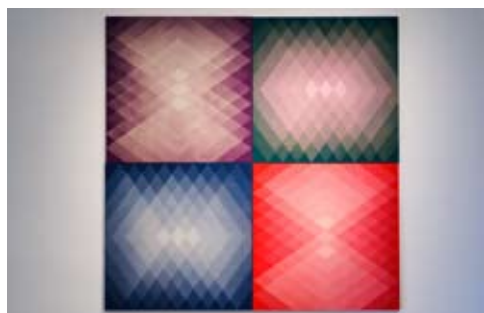
Untitled losange 2. 2013 Bleach on coloured canvas, 200 cm x 200 cm Private collection, courtesy of the artists & Crèvecoeur, Paris

Extracts from the 2014 Marcel Duchamp Prize catalogue (text Pascal Rousseau)