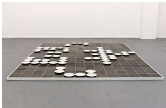
Game of Life, 2012 Tiles, plates, 280 x 340cm Production: Frae Basse-Normandie. Courtesy galerie Jousse Entreprise. Photo Copyright: Aurélien Mole