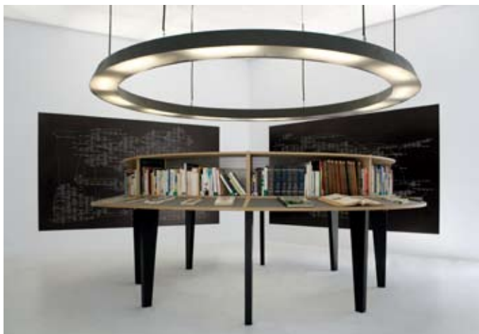
La totalité des propositions vraies (avant), 2008 Books, oak, plywood, metal, diameter: 380cm, height : 155cm