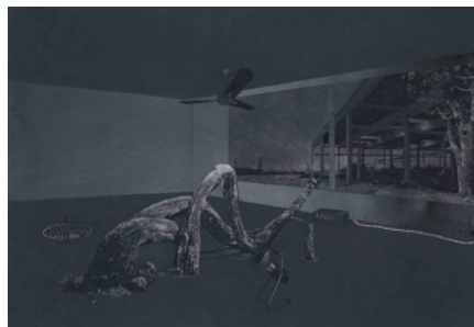
03 Sans titre (de la série "Remanences") , 2008 Pencil on paper, lead, tin 76 x 113 cm