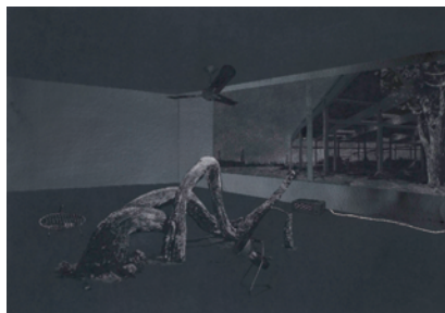
Sans titre, série « Rémanence », 2008 pencil on paper, lead, tin - 76 x 113 cm

Authors: Jean-Pierre Bordaz, Elie During