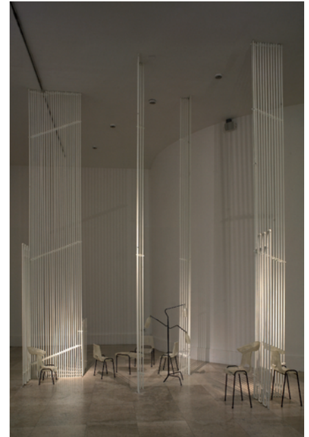
04 "Polder" , 2005 Resin, metal, painted copper 454 x 500 x 450 cm Collection du Musée d'Art Moderne de la Ville de Paris