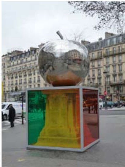
Franck Scurti, La Quatrième Pomme (Tribute to Charles Fourier) 2007 Diverse materials Variable dimensions Public commission by the City of Paris, Place Clichy