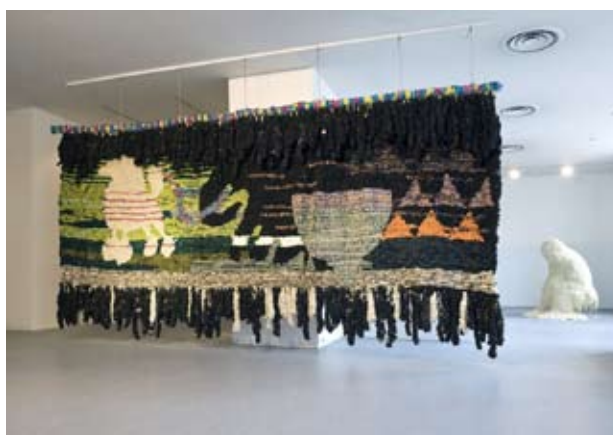
Dewar & Gicquel Mammoth and Poodle, 2010 Wool / 900 x 450 cm Courtesy of International Contemporary Art Foundation / Collection of Laura Lee Brown and Steve Wilson, Louisville, Kentucky Courtesy Loevenbruck Gallery, Paris / Musée d'Art moderne de la ville de Paris/ARC - Palais de Tokyo 2010.