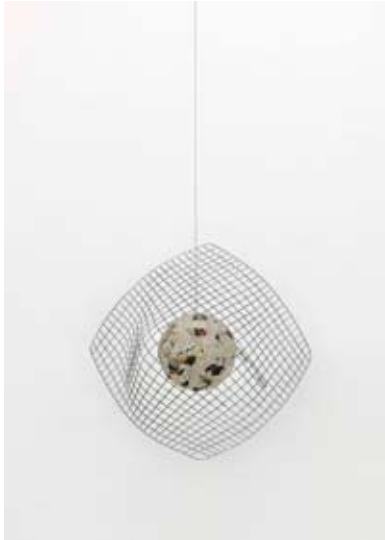
Franck Scurti Diamond chair: Relativité Générale #B 2008 Chrome-plated steel, newspaper 80 x 80 x 30cm Courtesy of the artist & Michel Rein Gallery, Paris