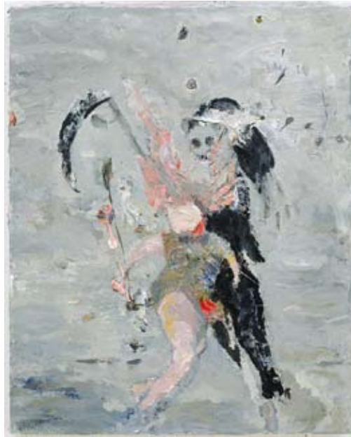
Valérie Favre Lapine Univers et la Mort 2007 huile sur toile 50 x 40 cm collection privée