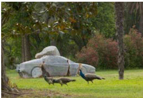
Dewar & Gicquel Mason Massacre, 2008 Castelnou marble 410 x 190 x 200cm Private collection, Monaco