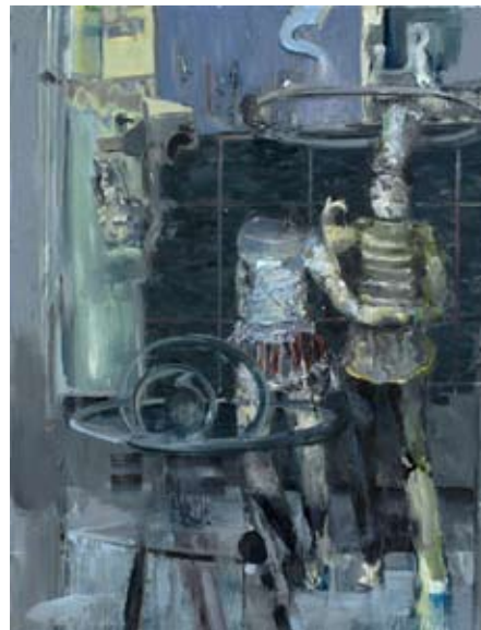
Valérie Favre Second Life 2007 huile sur toile 170 x 130 cm Collection privée