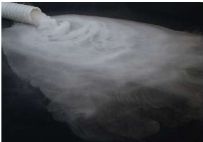
Bertrand LAMARCHE Map, 2011 180 x 220 x 75cm Installation, fabric, PVC tube, vinyl casing, smoke machine, table and trestles, timer