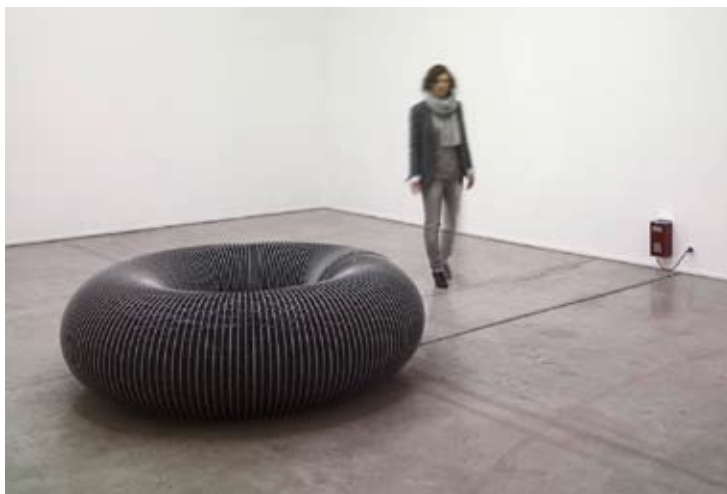
Bertrand LAMARCHE Lobby (hyper-tore), 2010 View of the installation in the Palais de Tokyo, 2010 160 x 160 x 60cm