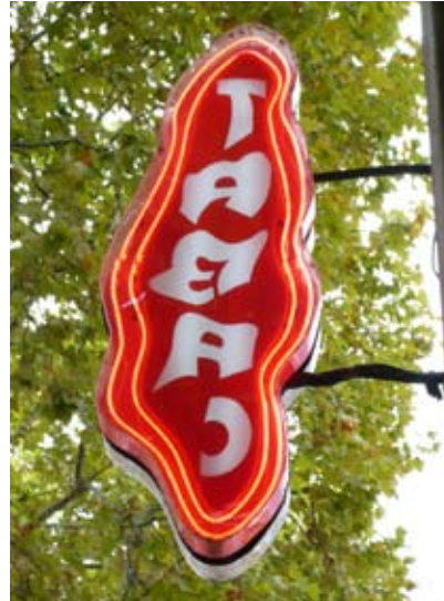
Franck Scurti Reflets Tabac (série B) 2004 Luminous sign: neon, Plexiglas 150 x 70 x 40cm Courtesy of the artist & Michel Rein Gallery, Paris