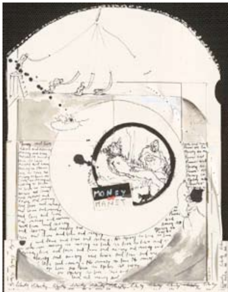
Valérie Favre No money, no Manet 2011 collage incl. photocopie: colle, encre de chine, aquarelle sur papier 26 x 20.8 cm