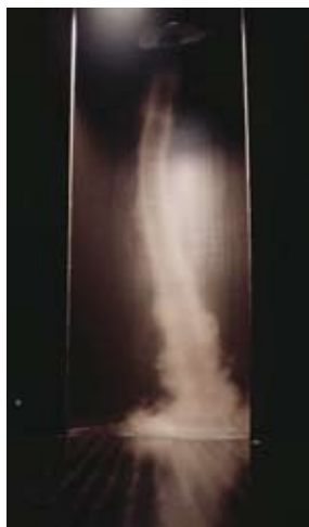
Bertrand LAMARCHE Le Rotor, 1997 Metal, bois, air humidifier, spot, propeller, timer, tarmac surface, 220 x 100 x 200cm Collection of the Fonds National d'Art Contemporain, (FNAC, Ministry of Culture) courtesy galerie Jérôme Poggi, Paris